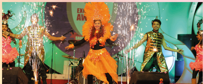
Indo-western performance by Dance Troupe