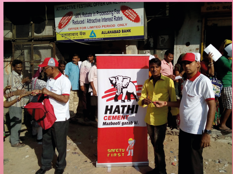
Helping public at Bank queues at Ahmedabad

With the objective to give impetus to the business through review of performance and advance planning, a Marketing Organizers meet was held at Bhuj on 17th December, 2016. This meeting aims at facilitating interactions between channel partners and market organizers (MO), gathering customer feedback, identifying opportunities and creating business plans.