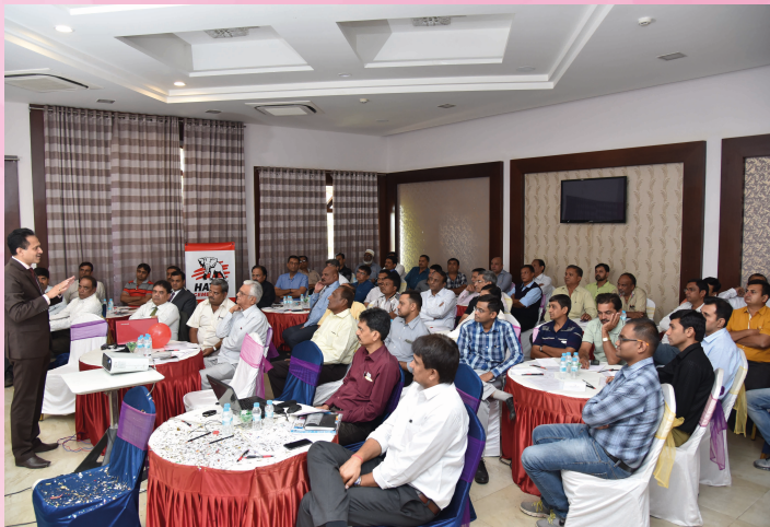
Sharing performance updates...