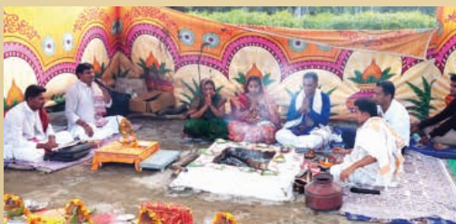
Hawanashtami Yagna in process

The auspicious occasion of Deepawali was celebrated with joy & enthusiasm. The Laxmi & Chopda pooja was performed at the administration building followed by bursting of crackers by children at Sidheegram