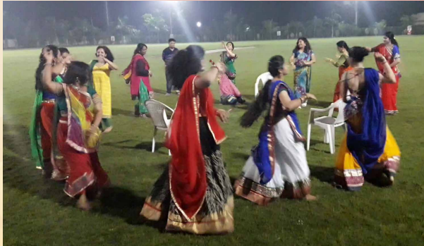
Garba in full swing