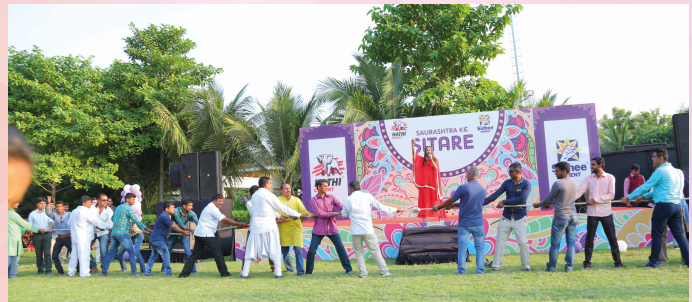
Tug of war competition

To celebrate Diwali, a mega event, Deepotsav, was organised for the Saurashtra Cement dealers and their families at Rajkot. Everyone thoroughly enjoyed the Deepotsav Carnival that included a fabulous orchestra, teamed with entertainment and games followed by dance & music. Various competitions like rangoli, tug-of-war, Chote Sitare-singing and dancing were also organised.