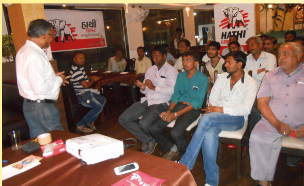
Contractors & Masons at the Influencer Meet at Thakkarnagar, Ahmedabad