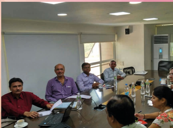
IMS Training workshop held at Ahmedabad

At the time of demonetization, when the common public was in dismay, our branding department took the initiative to help the general people standing in bank queues to fill forms, and provided information regarding the procedure. Pens were distributed for hassle free transactions.